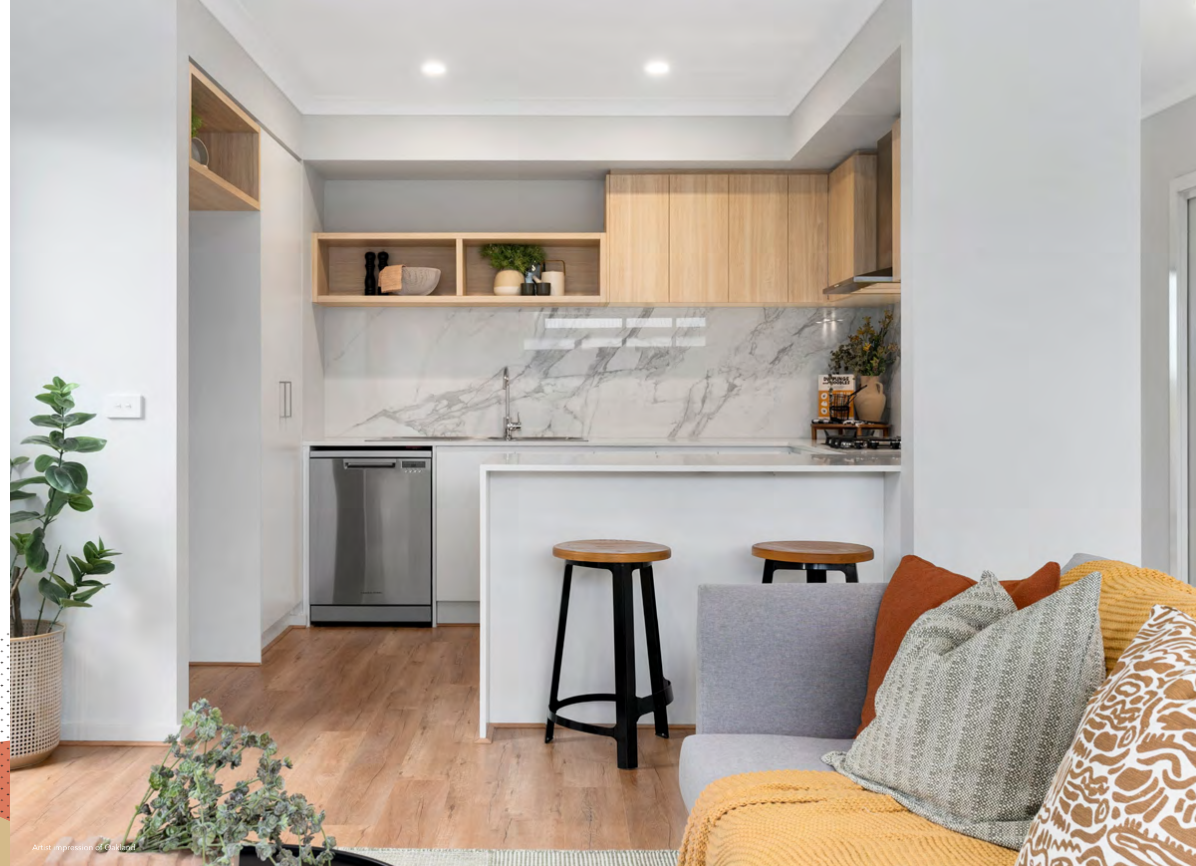
Artist impression of Oakland

Delivered by Dahua in conjunction with SOHO Living, Enclave offers a range of architectural townhomes that maximise natural light, space and style.