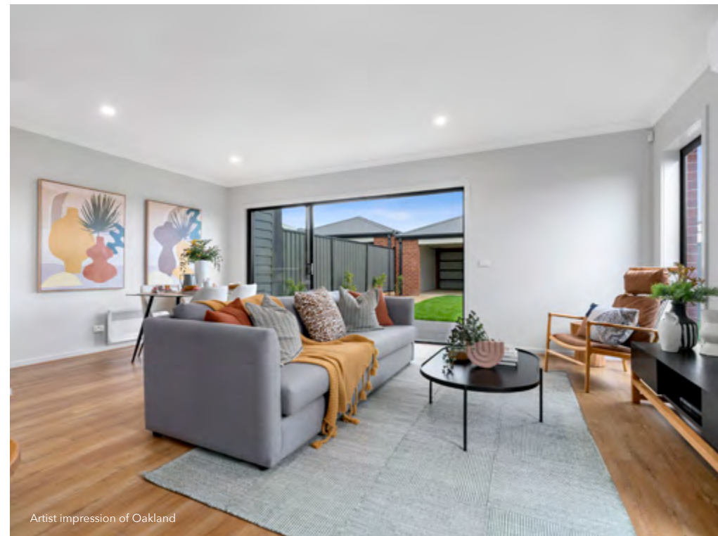
Artist impression of Oakland

Your Enclave home presents as a complete turnkey package with front and rear landscaping and high-end inclusions as standard, set within the vast natural beauty of Riverhills.