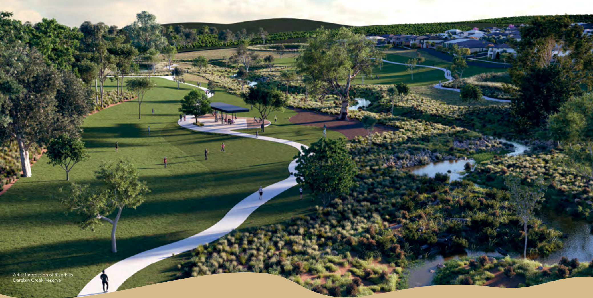
Artist Impression of Riverhills Darebin Creek Reserve

Every Enclave townhome is within walking distance of the sublime natural features that flow gently through the heart of the estate, so you will experience an uplifting connection to the natural environment. With a world of amenities nearby, you are also close to the lifestyle essentials we all need for ultimate contentment.